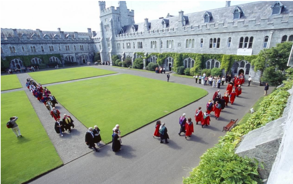
The Main Quadrangle